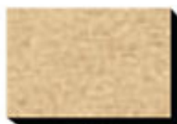
7813 Cardboard Solidz