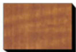
7284 Figured Annigre