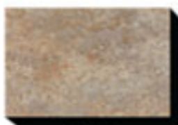
3687 Autumn Indian Slate *Available in Class A*