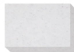
PL-140 Grey Speckle*

ACTUAL COLORS MAY VARY FROM THE COLOR ON YOUR SCREEN DUE TO MONITOR COLOR RESTRICTIONS. CONTACT COLUMBIA LOCKERS® AT 1-866-337-7286 TO REQUEST AN ACTUAL PANEL FOR A CLOSER MATCH.