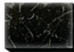
9251 Black Maise *Available in Class A*