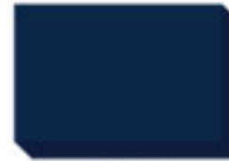
PL-300 Deep Blue**