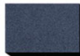
7018 Navy Grafix *Available in Class A*