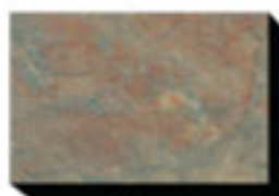
7014 Colorado Slate