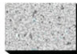
692 Folkstone Celesta *Available in Class A*