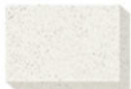
PL-120 Sand Speckle*