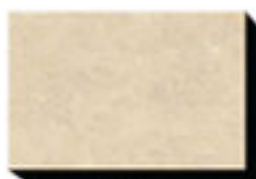
7022 Natural Canvas