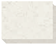
Sand Speckle* PL-120